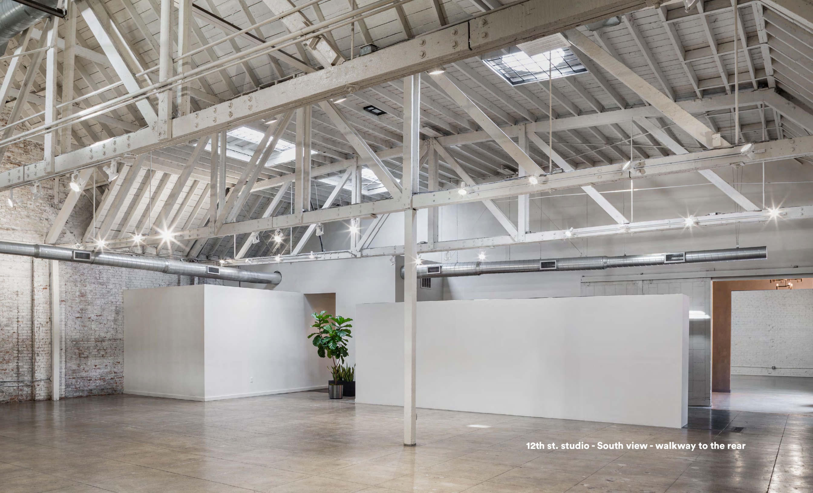
12th st. studio - South view - walkway to the rear