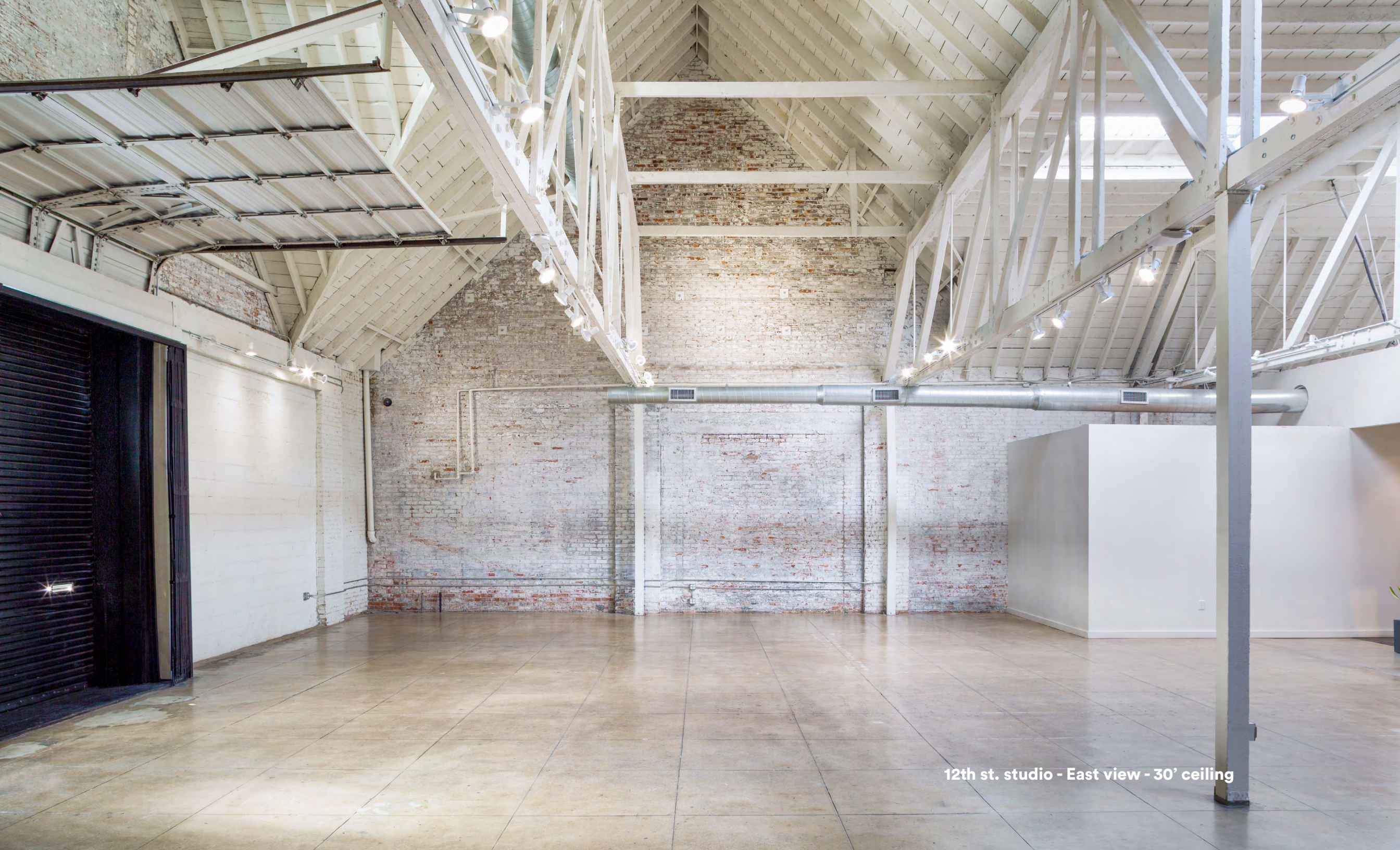
12th st. studio - East view - 30' ceiling