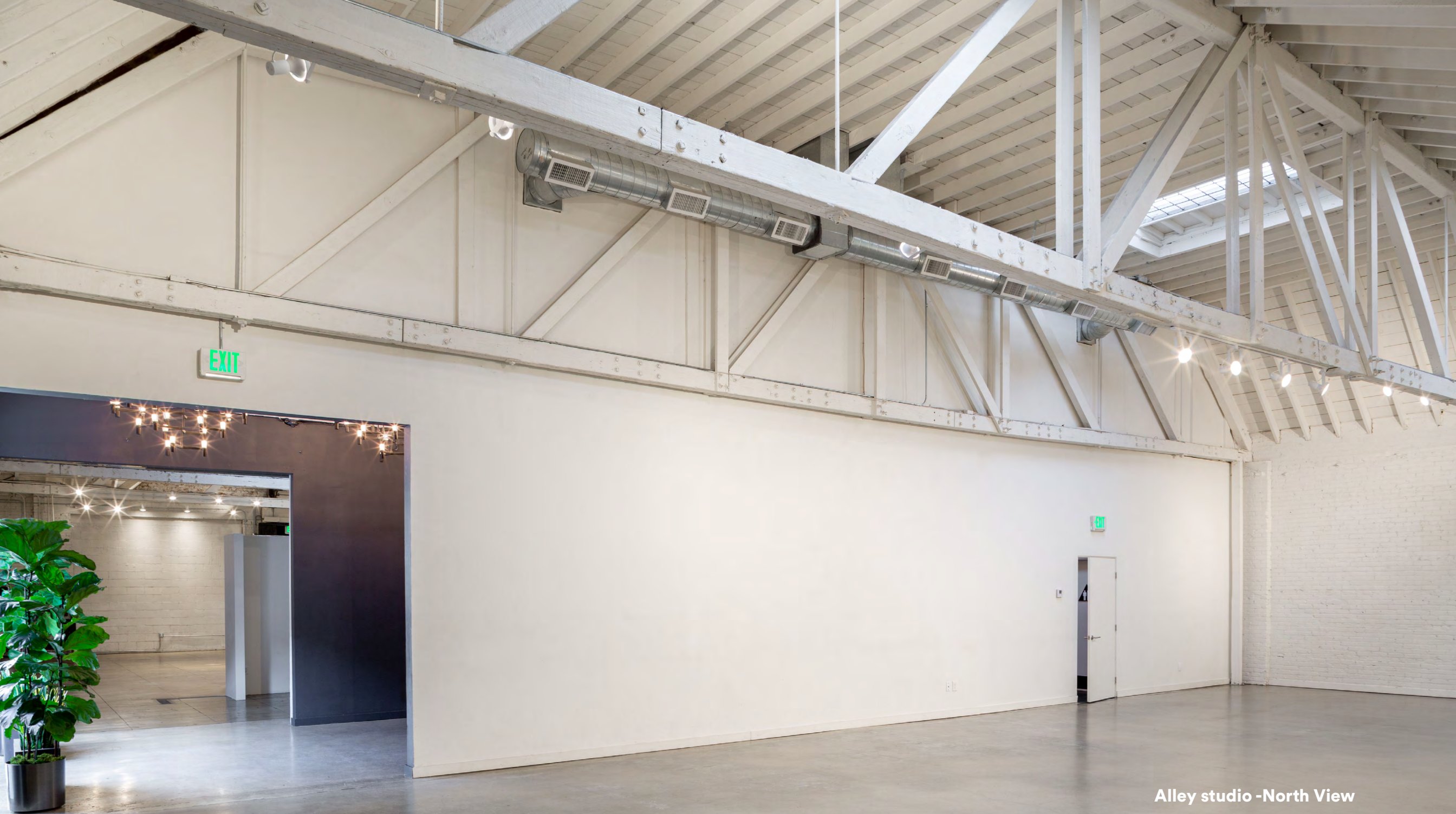
Alley studio -North View