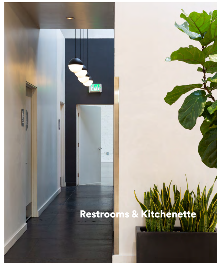
Restrooms & Kitchenette