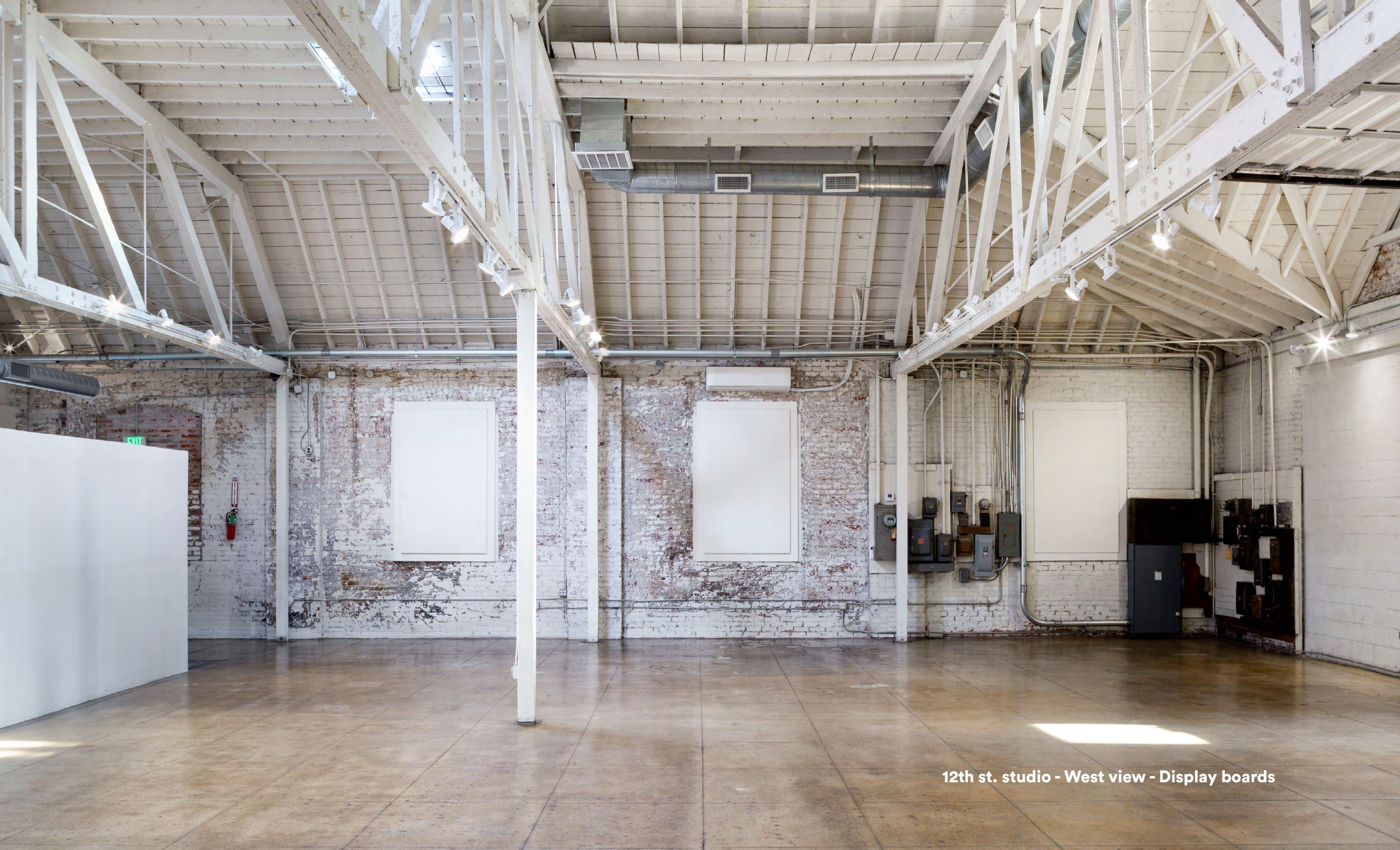
12th st. studio - West view - Display boards