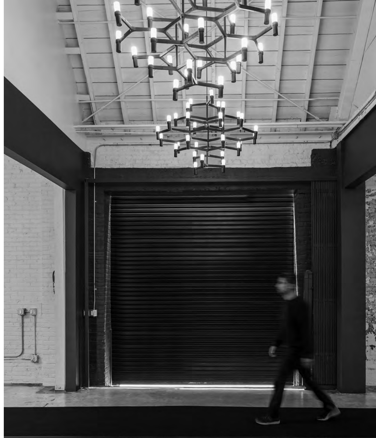
Transition from the front to the rear