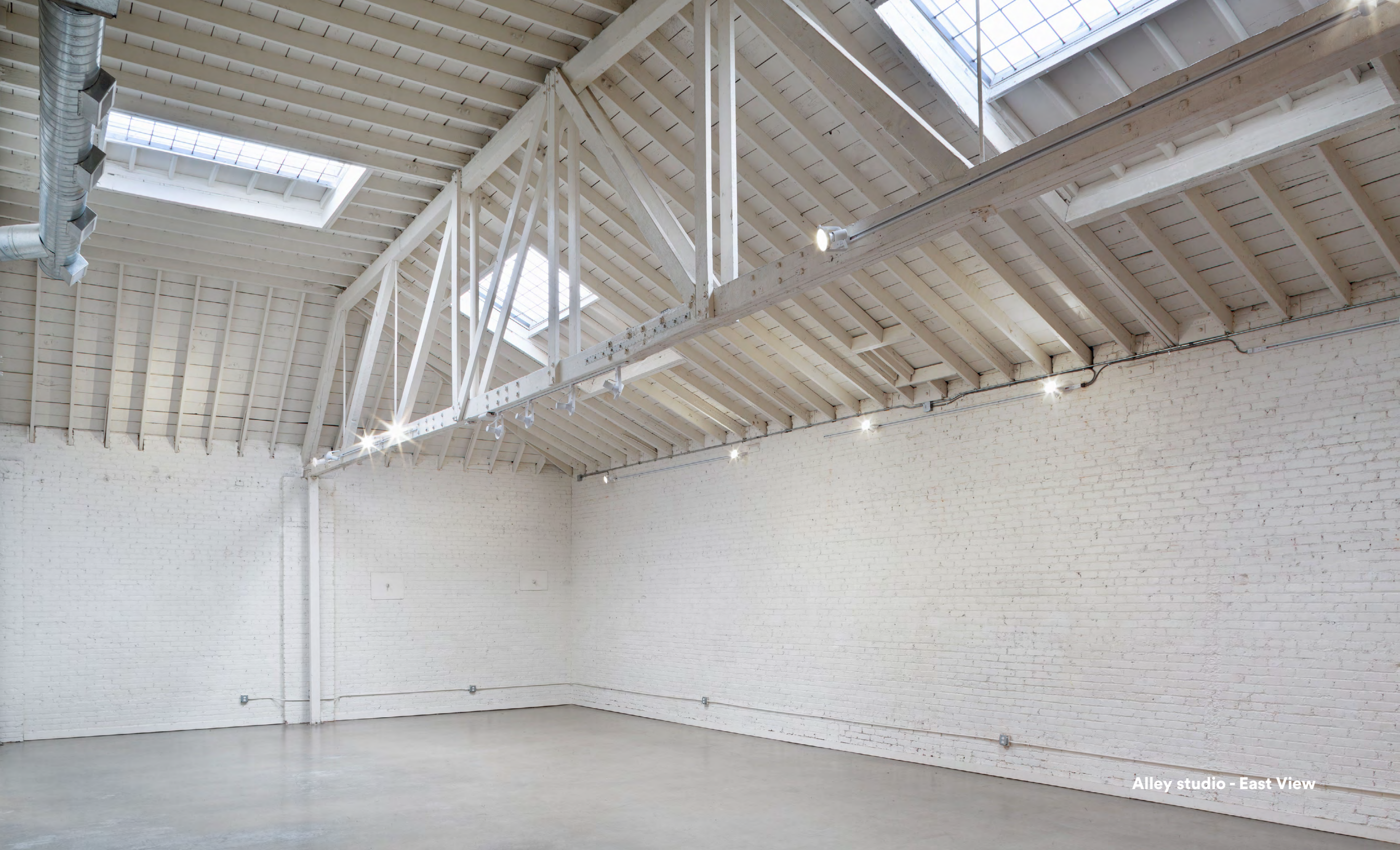
Alley studio - East View