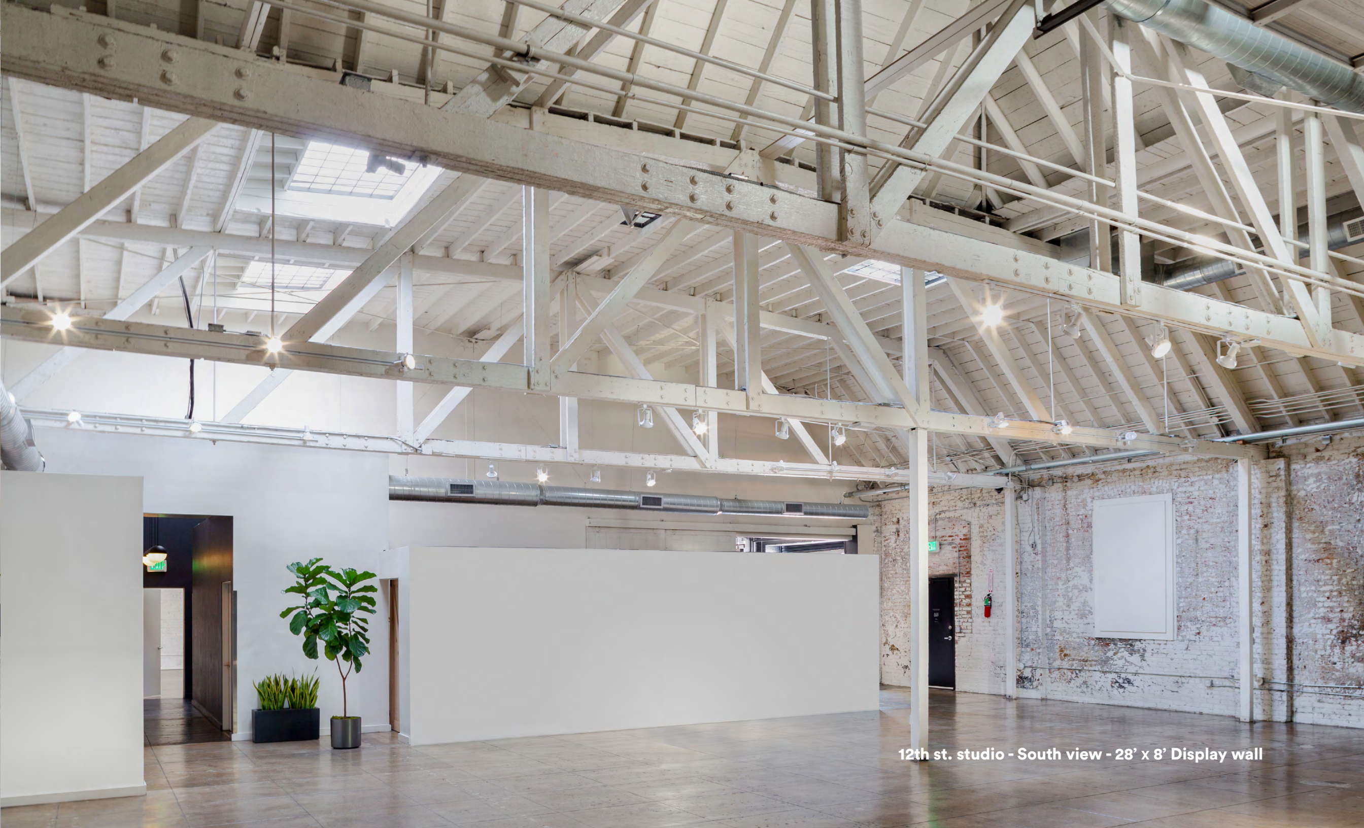
12th st. studio - South view - 28' x 8' Display wall