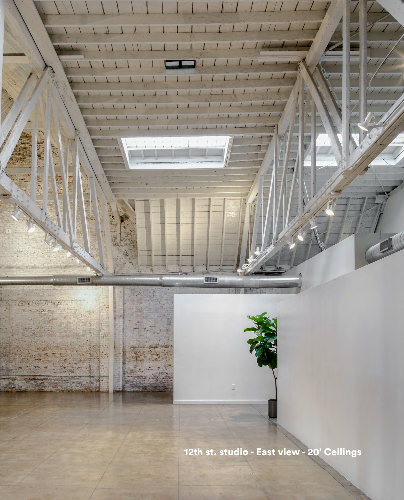
12th st. studio - East view - 20' Ceilings